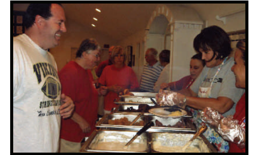
Here they come!!