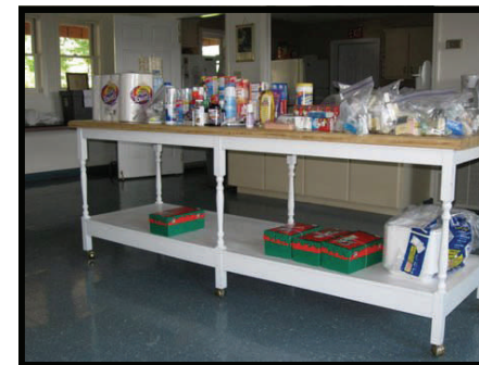
Options Donations ready to send